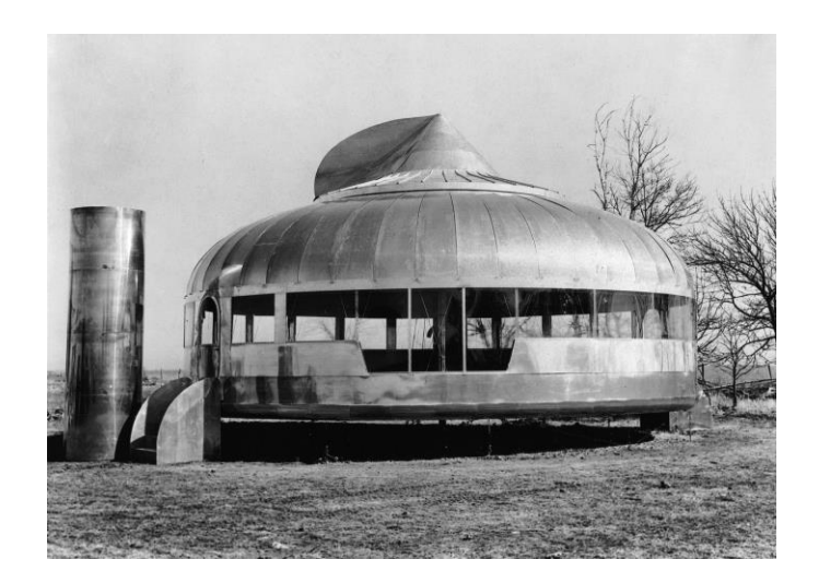
Figure 3. Dymaxion House designed by B. Fuller in 1940.